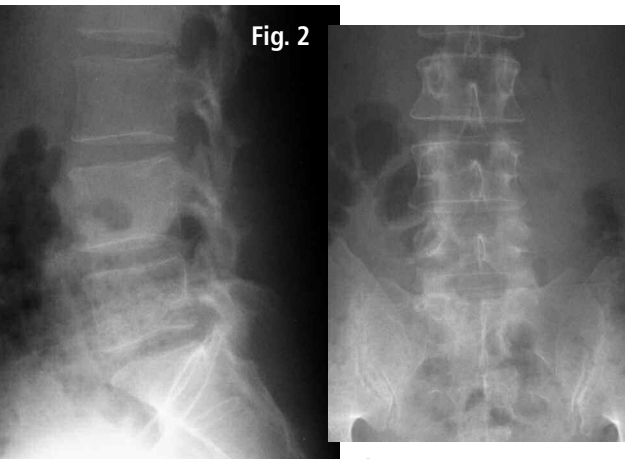
Fig. 2: Lateral & AP weight-bearing lumbar spine radiographs revealing a mild levorotatory lumbar scoliosis with right lateral flexion and left posterior rotation of L4 upon L5. Note the flattening of the lumbar lordosis with approximately 50% loss of disc space present at the L5/S1 level. These changes are thought to be an antalgic posture. No other signs of degenerative change are seen in the lumbar spine.

During this trial of divergent care, plain film radiographs and MR images of the lumbar spine were obtained. The radiographs were performed in the weight-bearing position and included anteroposterior and lateral projections. They revealed a slight levorotatory lumbar scoliosis and significant flattening of the lumbar lordosis. These films suggest an acute clinical presentation. The disc space at L5/S1 demonstrated approximately 50% loss of height; no other signs of degenerative change were seen (i.e. sclerosis, spondylophytosis) (Fig. 2). The MRI was performed on an upright unit and the images were taken in the neutral seated (weight-bearing) position using standard imaging protocols. The T1- and T2-weighted sagittal and axial images were reviewed by a chiropractic radiologist and collectively revealed discal dehydration and desiccation at the L4/5 level with underlying degenerative bulging of the disc. There was no disc herniation at this level. A left paracentral disc herniation (extrusion) was present at the L5/S1 level, which posterolaterally displaced the left